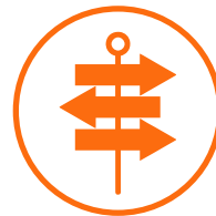
Responsible Decision Making